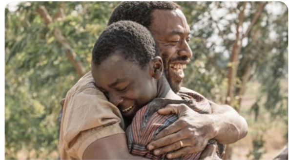
Watch The Boy Who Harnessed the Wind | Netflix

You will need to 'join' the Netflix 'unlimited tv programmes and films'.