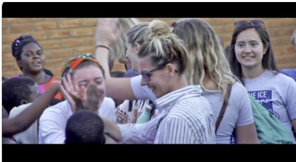
The 2018 Orbis Challenge- Dame Kelly Holmes youtube.com

A video showing Dame Kelly Holmes taking part in a triathlon expedition across Malawi ('sport with a purpose'). The video also shows Dame Kelly Holmes getting to know the people and the country.