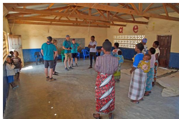
above – Berkshire Scouts will be refurbishing this existing community centre at Kausiwa.

Project Site 2 is at the village of Kausiwa (a 30 minute walk from Project Site 1).