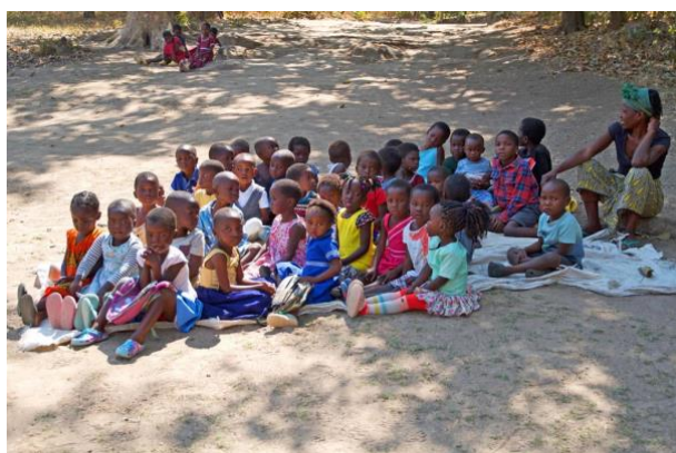
above – local pre-school children that will benefit from the new community building.

Bulletin 4 provides a brief overview of the adventure which lies ahead.