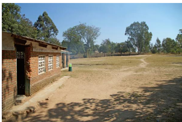
above – camping area at Project Site 1 (Milo, near Blantyre). This will be the main base and operational centre for Malawi 2024.

The main task at Project Site 1 (Milo) is to build a new community centre which will be used by pre-school children during the day and provide a much needed multi-purpose space for the local community.