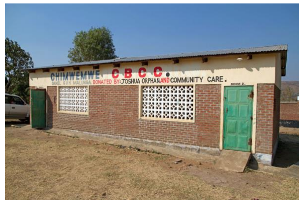
above – this building (built by 'Joshua') will be replicated at Project Site 1 (Milo). The building contains two spacious rooms and a store.

The main task at Project Site 1 (Milo) is to build a new community centre which will be used by pre-school children during the day and provide a much needed multi-purpose space for the local community.